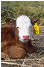
Focusing on all Aspects of the Beef Industry