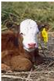
Focusing on all Aspects of the Beef Industry